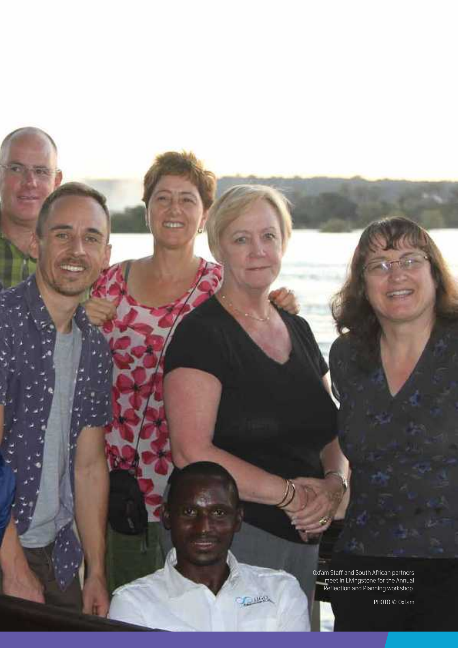
Oxfam Staff and South African partners meet in Livingstone for the Annual Reflection and Planning workshop.