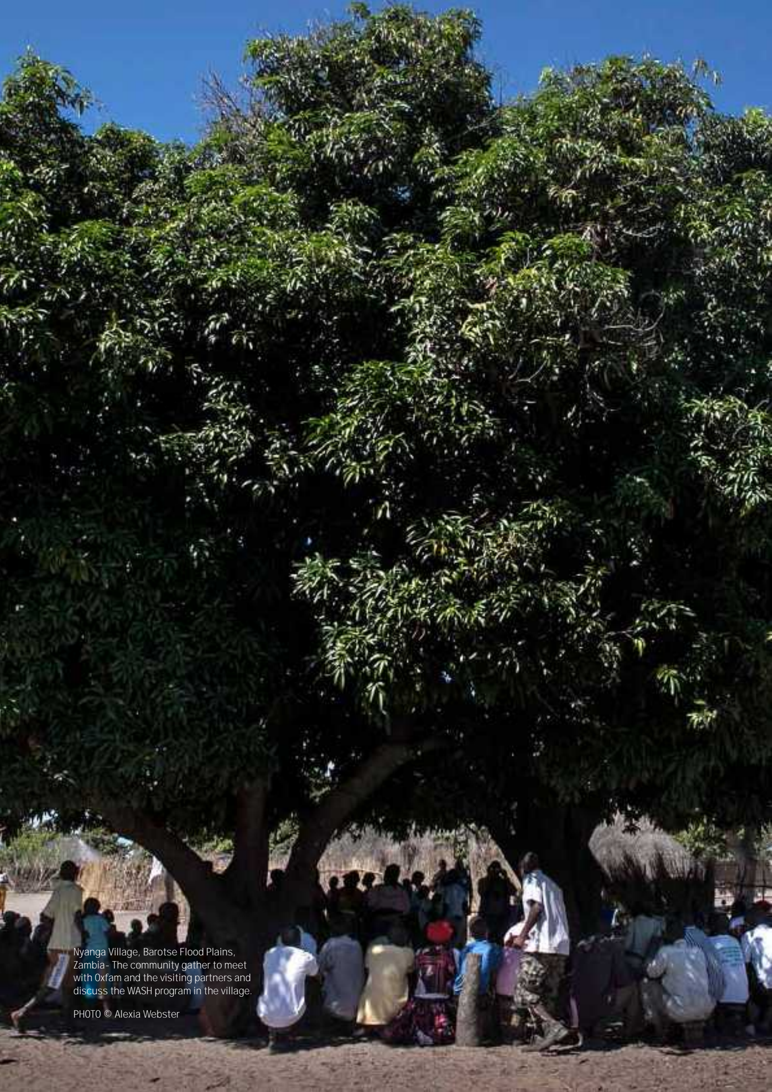
Nyanga Village, Barotse Flood Plains, Zambia- The community gather to meet with Oxfam and the visiting partners and discuss the WASH program in the village.