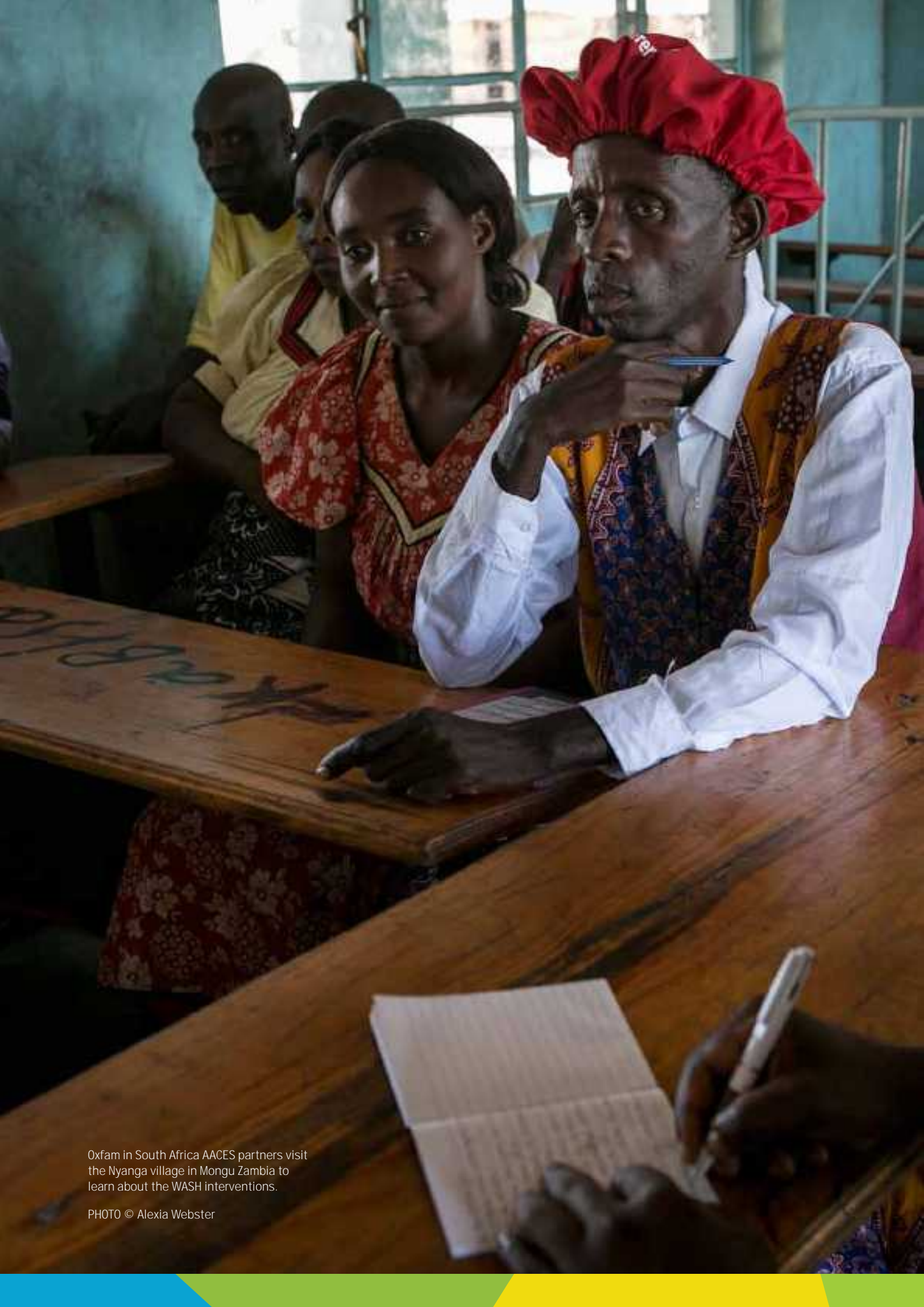
Oxfam in South Africa AACES partners visit the Nyanga village in Mongu Zambia to learn about the WASH interventions.